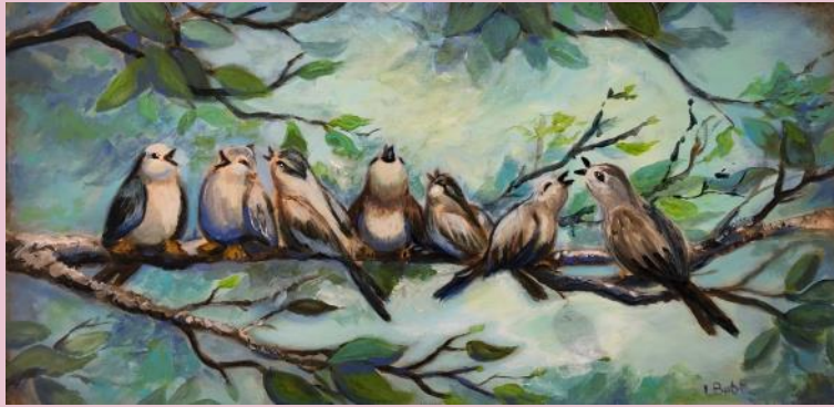
Bird Song by Lorrie Bubb