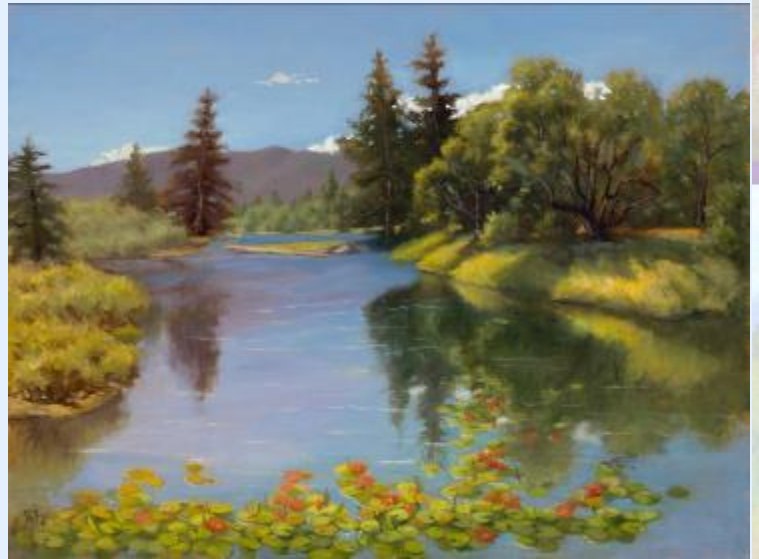
Summer Reflection on the Nestucca River by Sandy Fisher

Sandy Fisher, captures the magic of the landscape and flora with a sense of honesty and nuanced layers of color using strong compositional elements to provide a solid foundation to her artwork.