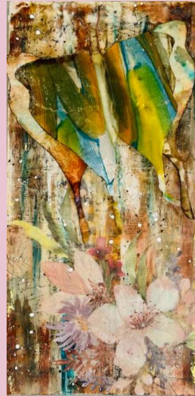
Lunosity in Motion by Trudy Callahan