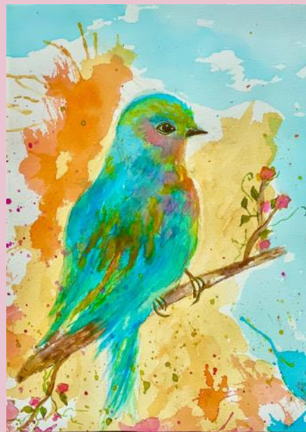
Sitting Pretty by Naomi Young