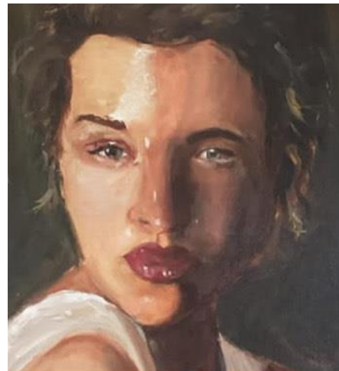
Reflections in Silence

From gilded elegance to minimalist cool, each piece captures the spirit of its time through style and expression.