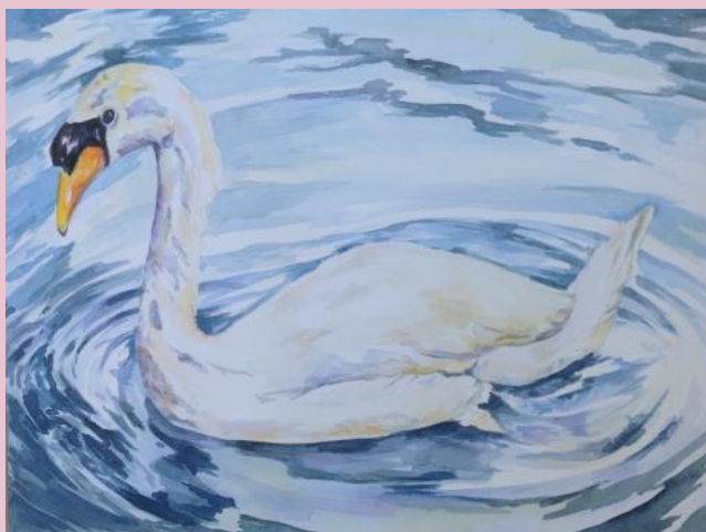
Swan Elegance by Charlotte Mullich